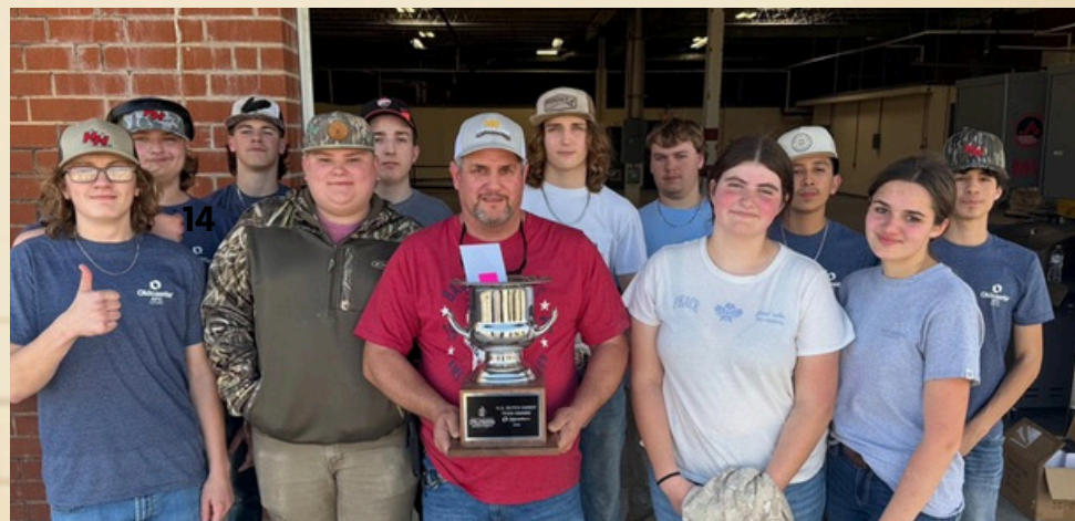
HA Butch Hardy Team Award: Richlands High School