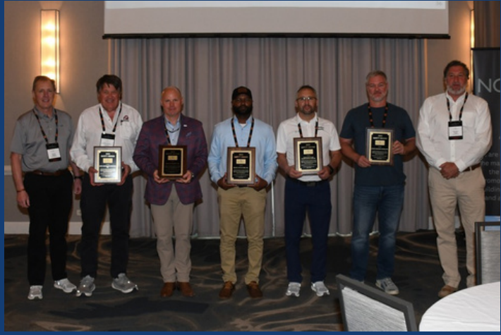
The following companies received Safety Awards presented by The Alera Group: Gates Construction Company, Manning Masonry, Brodie Contractors, Edgar Boettcher Masonry, Joyner Masonry.