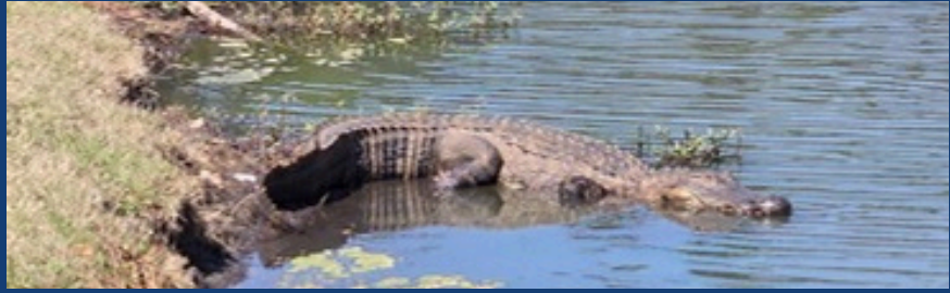
This year's wildlife sighting during the golf tournament featured an 8' long alligator!