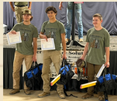
Advanced Level 3 Masonry Contest: