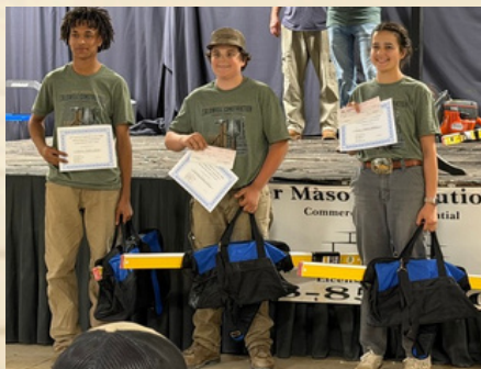
Masonry 1 Contest:

On May 8, students from Hibriten High School, South Caldwell High School, and West Caldwell High School competed in the 14th Annual Caldwell Trades Competition. A total of over $5,000 in cash prizes, tools, and gift cards were awarded to these hardworking students.