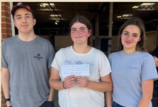
NCMCA Jr. Blocklayer: